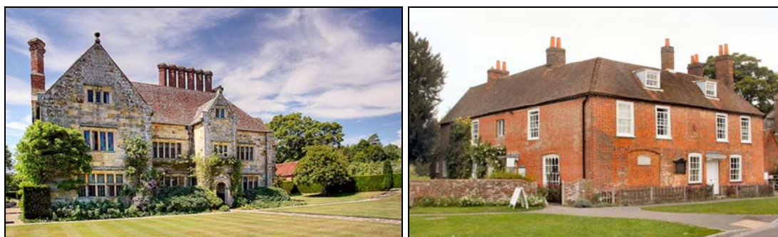
BATEMAN'S; JANE AUSTEN'S HOUSE AT CHAWTON

Day 3: Charleston Farmhouse , the country retreat of the Bloomsbury Group. Lovingly restored and maintained. Where the Bells, Clive and Vanessa, lived with their two boys, where Duncan Grant painted, and Lytton Strachey and the Woolfs visited. Monk's House , Virginia Woolf's house nearby. Lunch at the 500 year old Mermaid Inn . Visit to nearby Lamb House , in picturesque Rye, the 18th century home of Henry James from 1898-1916, and home also to the writers E. F. Benson and Rumer Godden. Charming walled garden and display of James's personal possessions. Afterwards to Bateman's , the home of Rudyard Kipling from 1902 to 1936. Firle Place , the home of the Gage family - General Gage was the British Commander-in-Chief at the time of Bunker Hill. Dinner at country pub.