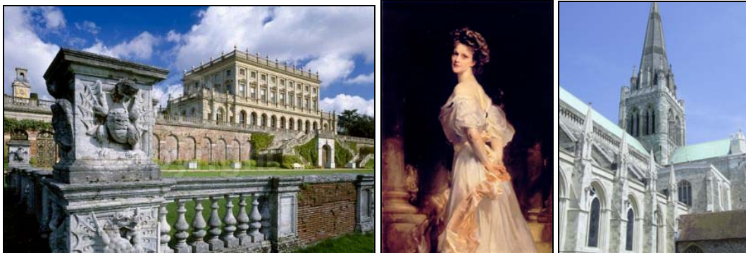
CLIVEDEN; LADY ASTOR BY SARGENT; CHICHESTER CATHEDRAL

Day 1: Meet at London Airport. To Cliveden - the home of the 'fabulous Astors', where Profumo met Keeler. 19th century House by Barry (who designed the Palace of Westminster), stunning position on the only cliff by the Thames, and beautiful Italianate garden. Short river trip to see the house from the water. Thence drive to Chichester. Local sites in City - Cathedral, Pallant House Art Gallery, St Mary's Hospital . Dinner in hotel.