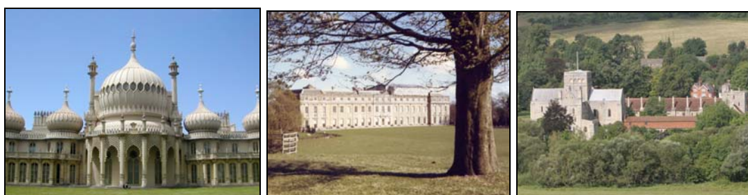
ROYAL PAVILION, BRIGHTON; PETWORTH; ST. CROSS