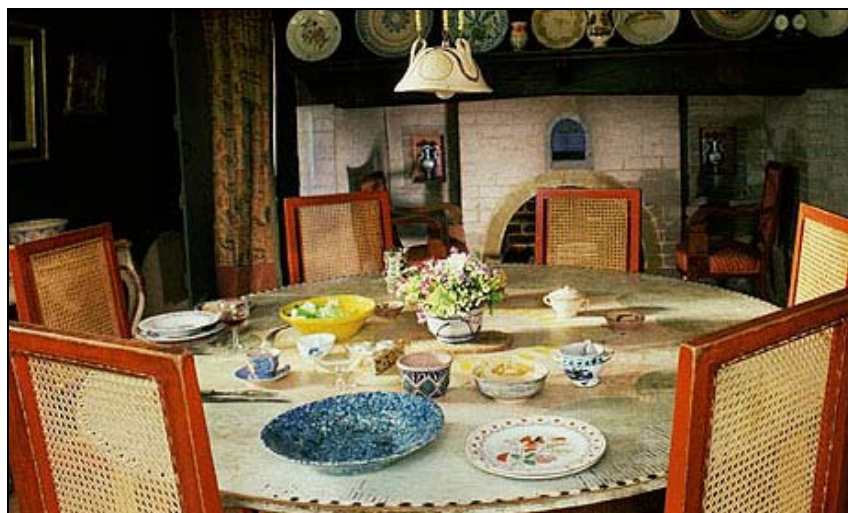
THE DINING ROOM AT CHARLESTON, AS IT WAS AND IS