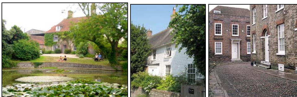
CHARLESTON; MONK'S HOUSE; LAMB HOUSE

Thence to Sissinghurst Castle and Garden. The Tudor house and tower were restored in the early 20th Century by Harold Nicholson and Vita Sackville-West, who created the garden from a chicken farm. Dinner at the Goodwood Club, owned by the Earl of March, eldest son of the Duke of Richmond, whose seat Goodwood House is visible from the Course.